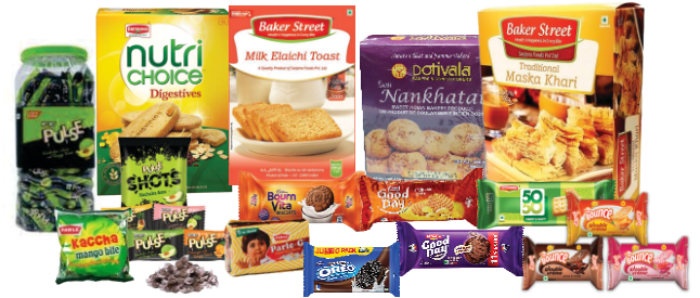
CANDY & BAKERY PRODUCTS