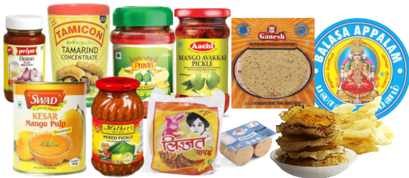
PICKLES, PAPADS & PULPS