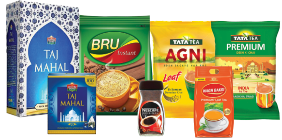
TEA & COFFEE