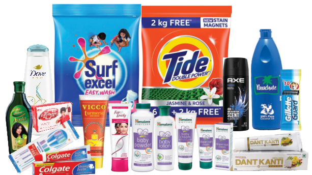
TOILETRIES & COSMETIC PRODUCTS