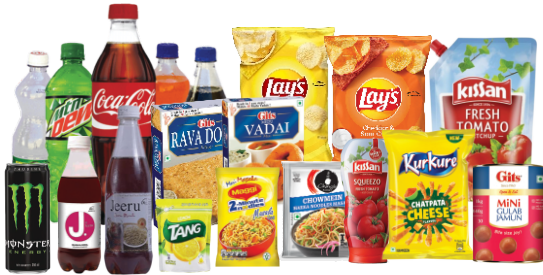
INSTANT FOOD & BEVERAGES