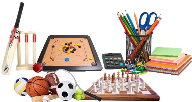
STATIONERY & SPORTS PRODUCTS