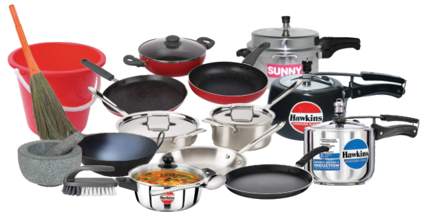
HOUSEHOLD & UTILITY PRODUCTS