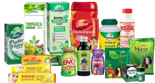
HERBAL & PHARMA PRODUCTS